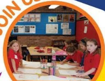
ART CLASSROOM 5/6G Class